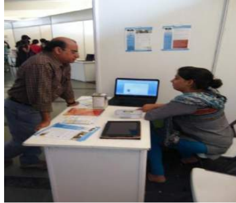
Parent making enquiries about Project Prayas