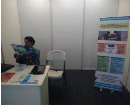
Autism Society of India Stall