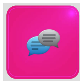
Bol App for iPad