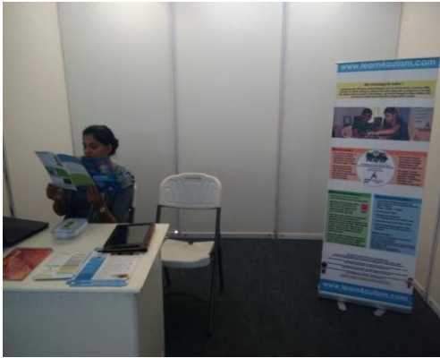
Autism Society of India Stall