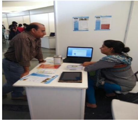
Parent making enquiries about Project Prayas